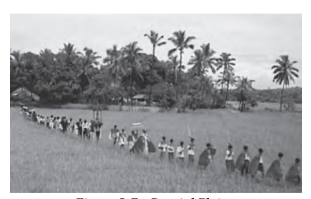
Figure 2.7: Coastal Plains

As compared to the western coastal plain, the eastern coastal plain is broader and is an example of an emergent coast. There are well-developed deltas here, formed by the rivers flowing eastward in to the Bay of Bengal. These include the deltas of the Mahanadi, the Godavari, the Krishna and the Kaveri. Because of its emergent nature, it has less number of ports and harbours. The continental shelf extends up to 500 km into the sea, which makes it difficult for the development of good ports and harbours. Name some ports on the eastern coast.