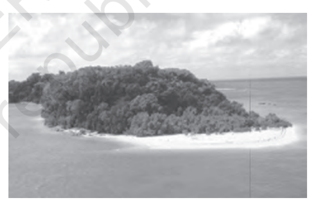
Figure 2.8: An Island

The islands of the Arabian sea include Lakshadweep and Minicoy. These are scattered between 8°°N-12°°N and 71°°E-74°°E longitude. These islands are located at a distance of 220 km-440 km off the Kerala coast. The entire island group is built of coral deposits. There are approximately 36 islands of which 11 are inhabited. Minicov is the largest island with an area of 453 sq. km. The entire group of islands is broadly divided by the Nine degree channel, north of which is the Amini Island and to the south of the Canannore Island. The Islands of this archipelago have storm beaches consisting of unconsolidated pebbles, shingles, cobbles and boulders on the eastern seaboard.