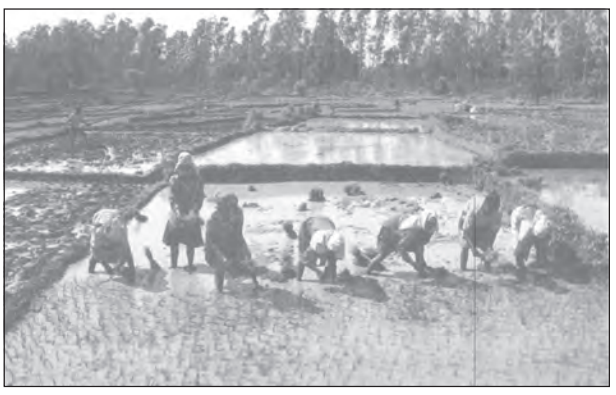
Figure 2.4: Northern Plain

The south of Tarai is a belt consisting of old and new alluvial deposits known as the Bhangar and Khadar respectively. These plains have characteristic features of mature stage of fluvial erosional and depositional landforms such as sand bars, meanders, oxbow lakes and braided channels. The Brahmaputra plains are known for their riverine islands and sand bars. Most of these areas are subjected to periodic floods