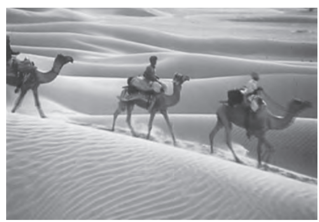
Figure 2.6: The Indian Desert

Can you identify the type of sand dunes shown in this picture?