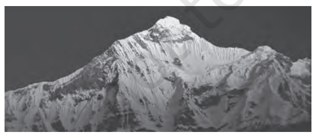
Figure 2.3: The Himalayas

Himalayas are not only the physical barrier, they are also a climatic, drainage and cultural divide. Can you identify the impact of Himalayas on the geoenvironment of the countries of South Asia? Can you find some other examples of similar geoenvironmental divide in the world?