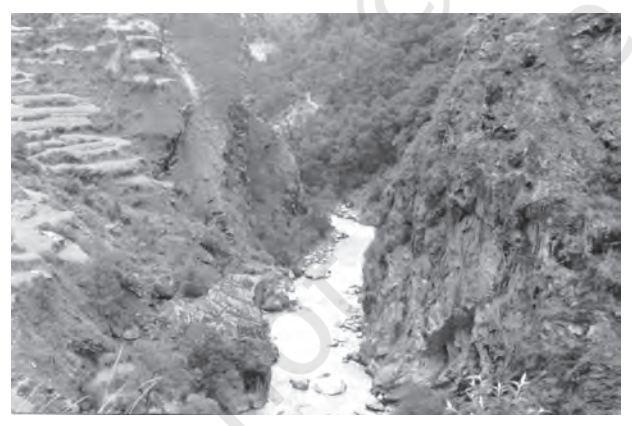
Figure 2.1: A Gorge

The Himalayas along with other Peninsular mountains are young, weak and flexible in their geological structure unlike the rigid and stable Peninsular Block. Consequently, they are still subjected to the interplay of exogenic and endogenic forces, resulting in the development of faults, folds and thrust plains. These