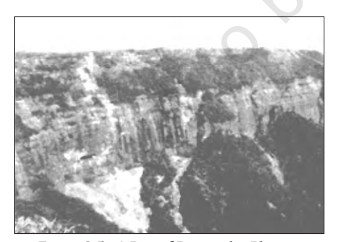
Figure 2.5 : A Part of Peninsular Plateau

Rising from the height of 150 m above the river plains up to an elevation of 600-900 m is the irregular triangle known as the Peninsular plateau. Delhi ridge in the northwest, (extension of Aravalis), the Rajmahal hills in the east, Gir range in the west and the Cardamom hills in the south constitute the outer extent of the Peninsular plateau. However, an extension of this is also seen in the northeast, in the form of Shillong and Karbi-Anglong plateau. The Peninsular India is made up of a series of patland plateaus such as the Hazaribagh